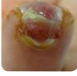
18 February 2013