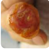
15 February 2013