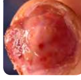
4 February 2013